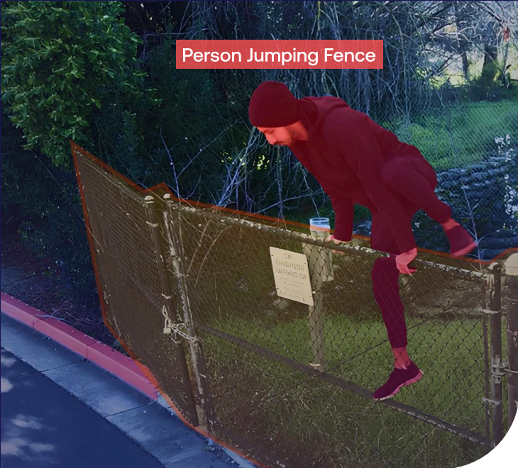
Person Jumping Fence